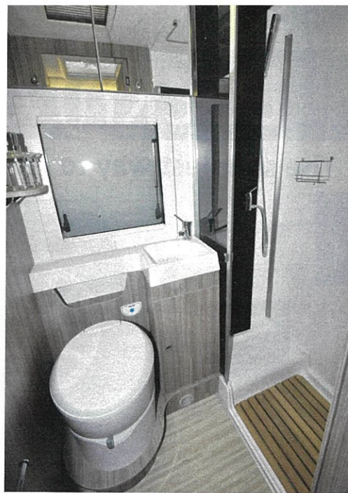
Above from left: drop-down double bed; good washroom with opaque window; fittings for a bike rack at rear

The only negative is that the bed does cut across the habitation doorway to a degree.