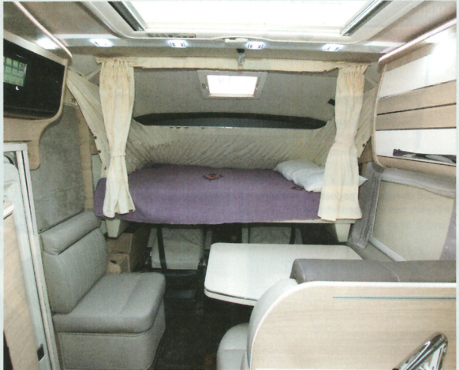
The manual drop-down bed has the essential roof vent above