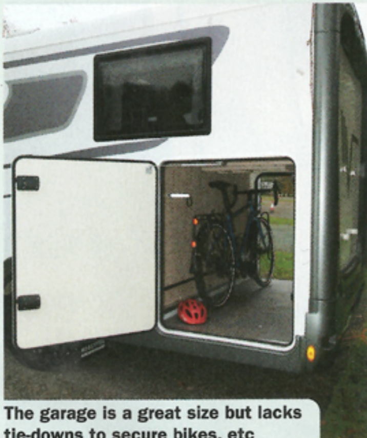
The garage is a great size but lacks tie-downs to secure bikes, etc