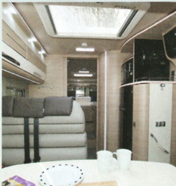
Looking aft, see the tall fridge/freezer with oven mounted above