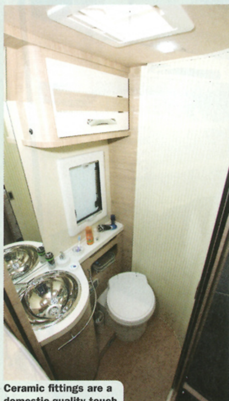
Ceramic fittings are a domestic-quality touch