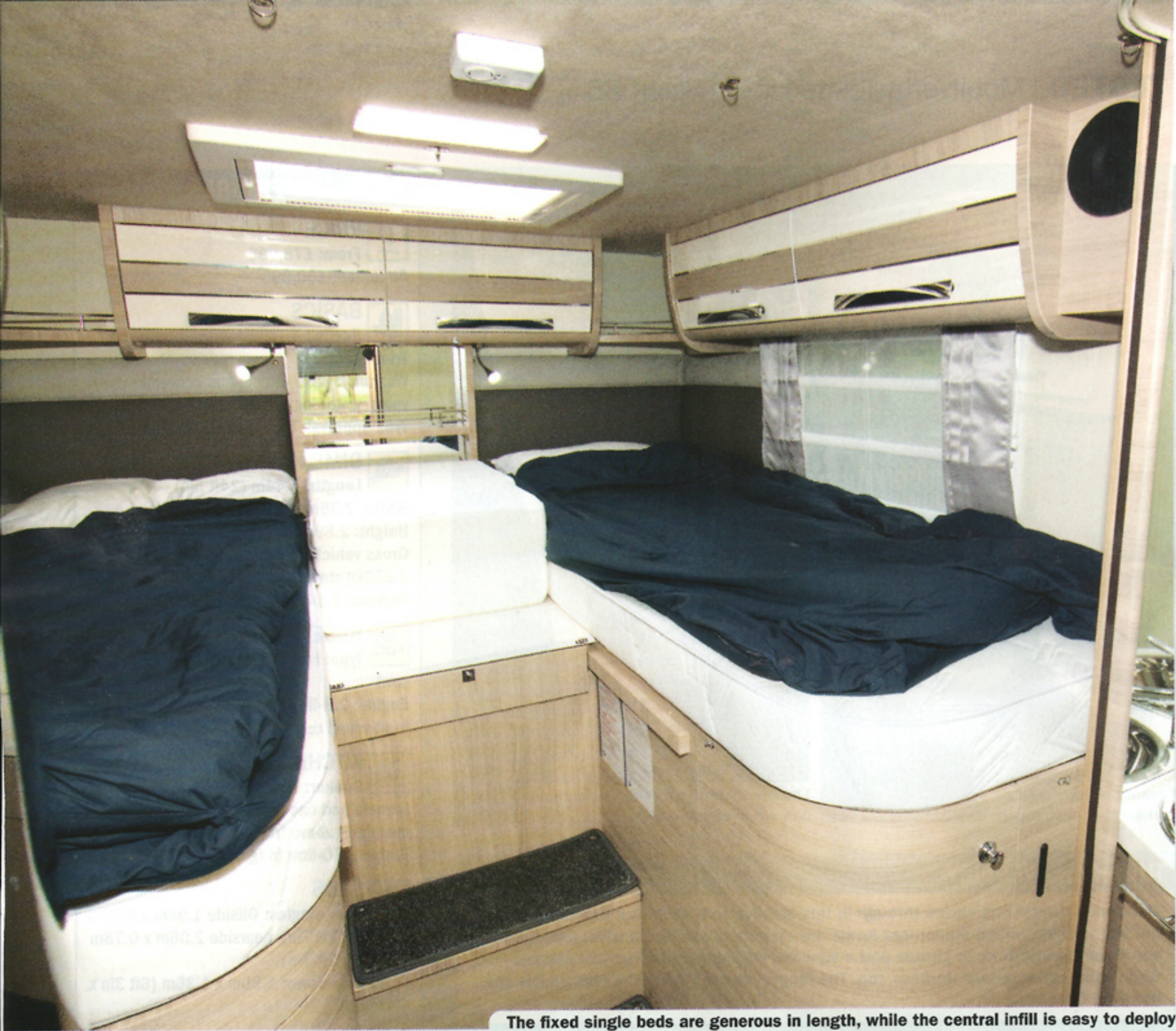
The fixed single beds are generous in length, while the central infill is easy to deploy

stylish motorhome, this detail looks a little out of place.