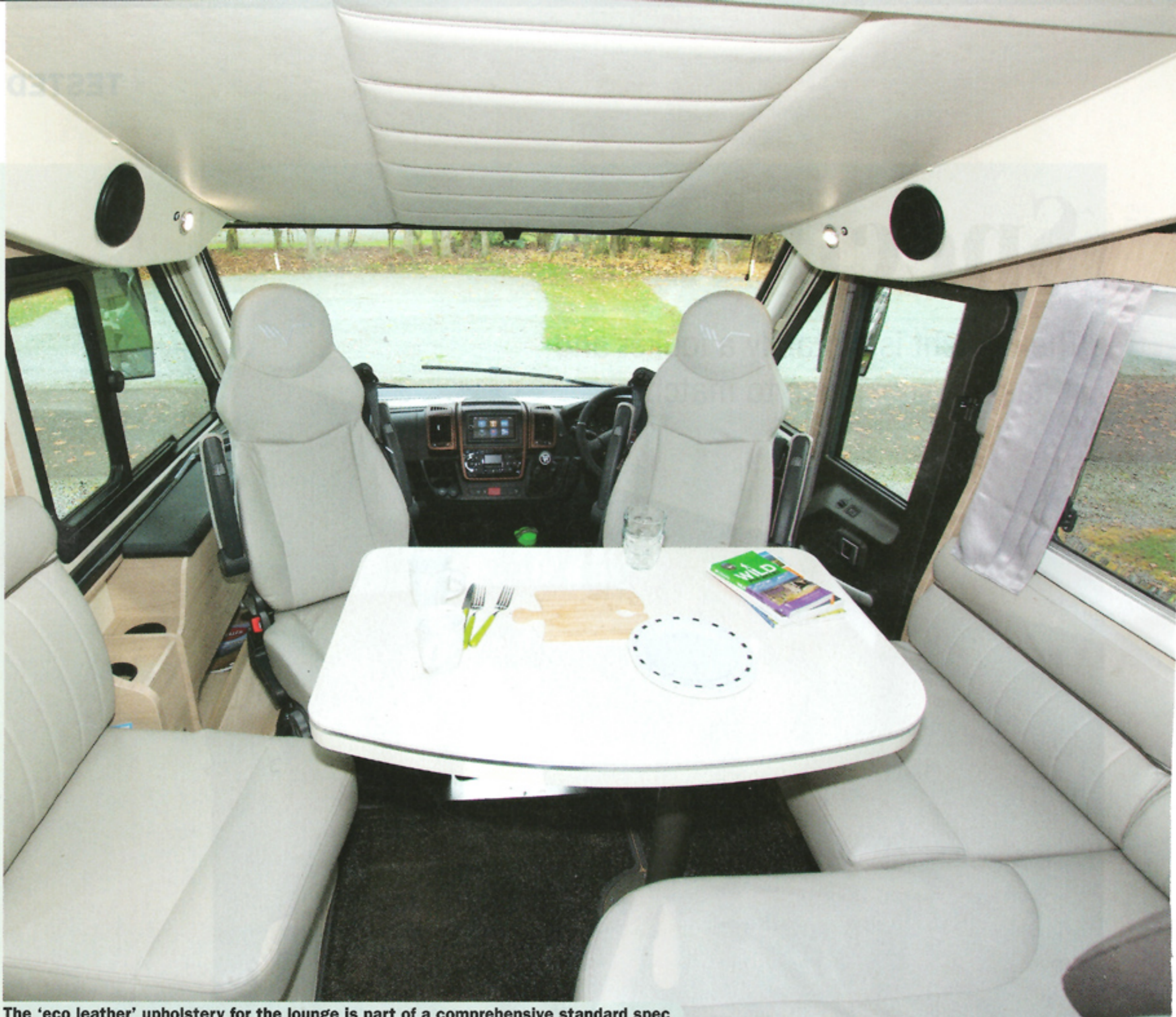
The 'eco leather' upholstery for the lounge is part of a comprehensive standard spec

F irst impressions count, they say, and the Mobilvetta K-Yacht 85 definitely looks impressive. It is competitively priced, too, at under £80,000, considering the high standard specification (and remarkably short options list).