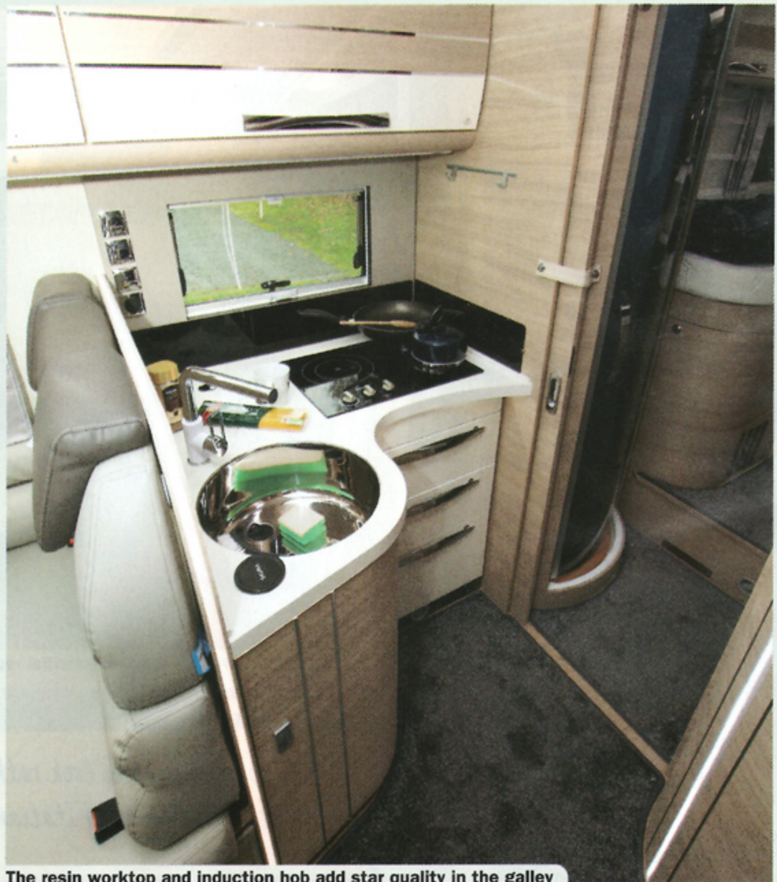
The resin worktop and induction hob add star quality in the galley

K-Yacht – except that this trim is actually animal-friendly, described as ‘Comfort Grey eco synthetic leather’.