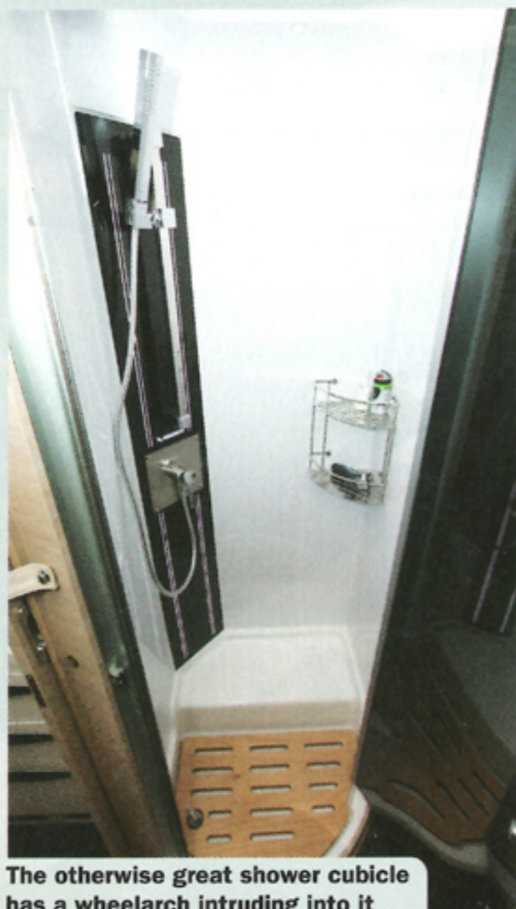
The otherwise great shower cubicle has a wheelarch intruding into it