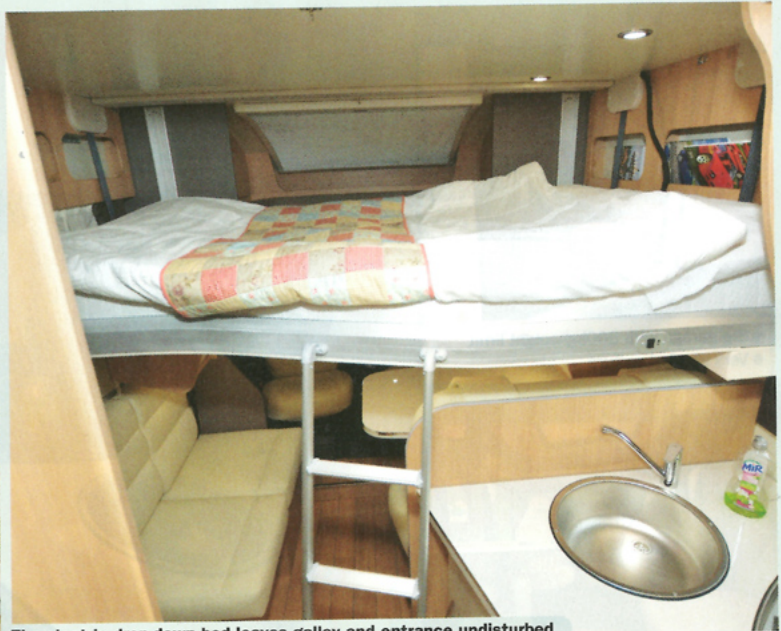
The electric drop-down bed leaves galley and entrance undisturbed