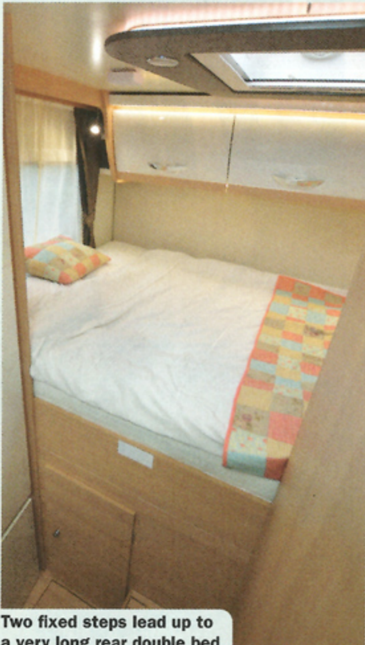
Two fixed steps lead up to a very long rear double bed