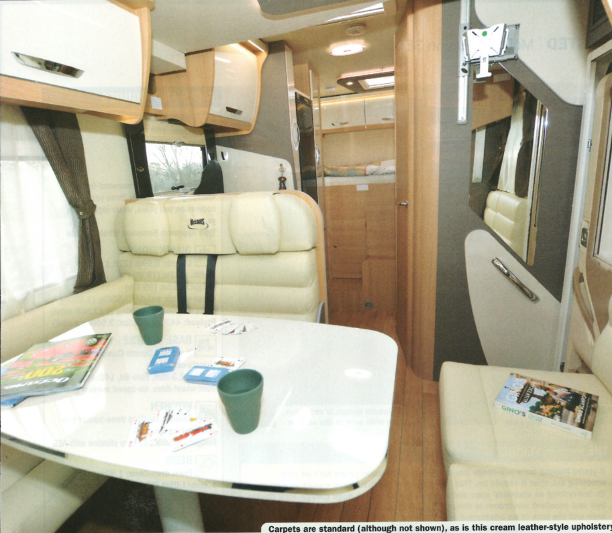
Carpets are standard (although not shown), as is this cream leather-style upholstery