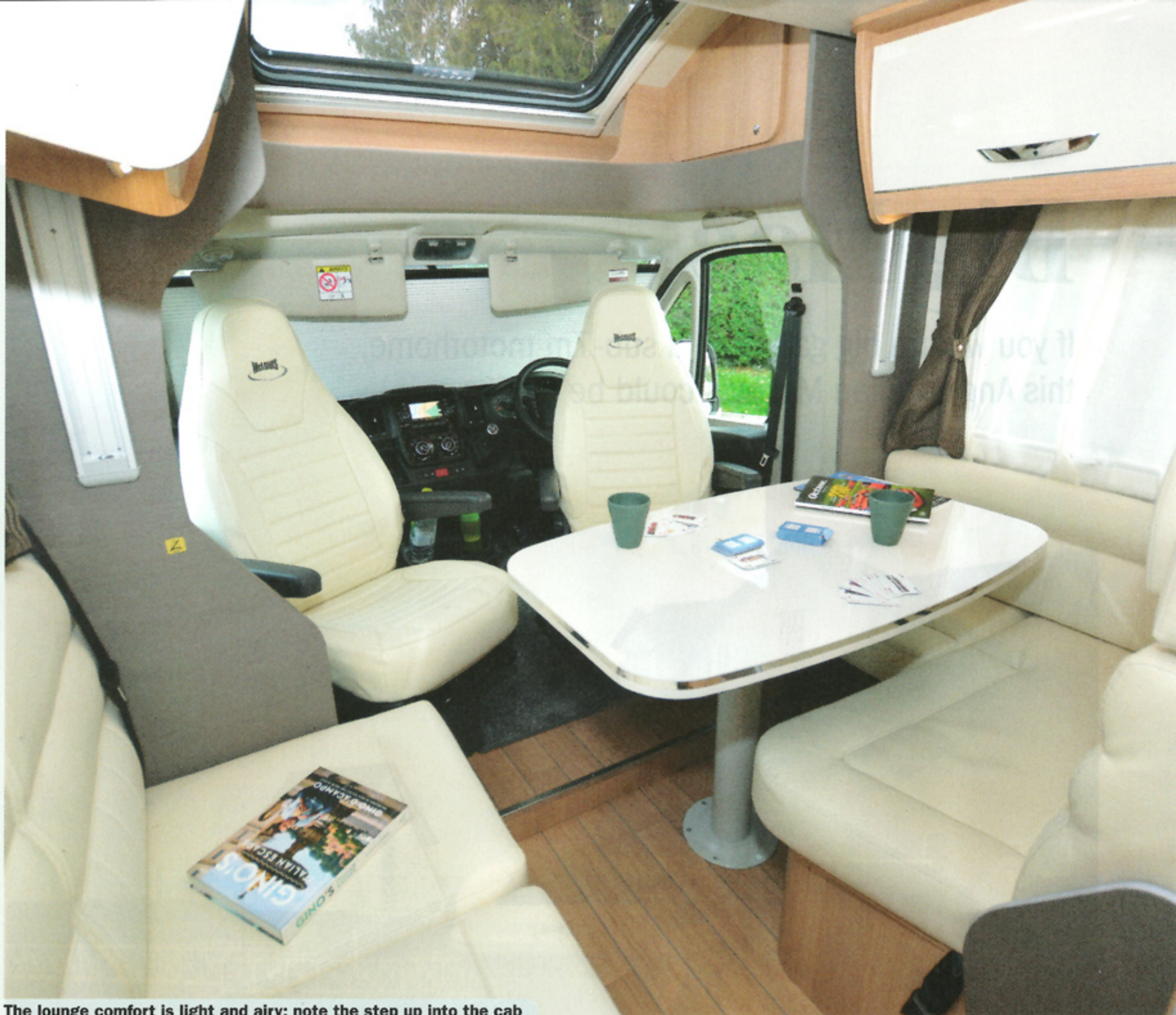
The lounge comfort is light and airy; note the step up into the cab

If you're wondering about the origins of the brand McLouis, the title comes from the merging of two neighbouring airport restaurant names (McDonalds and Louis) spotted when its founder was waiting for a flight. It sounds British, Scottish even, but is no more Anglo-Saxon than linguine alle vongole , although the latest models do aim to suit our tastes with on-board ovens and now, for 2020, UK-handed layouts with a nearside habitation door, too.