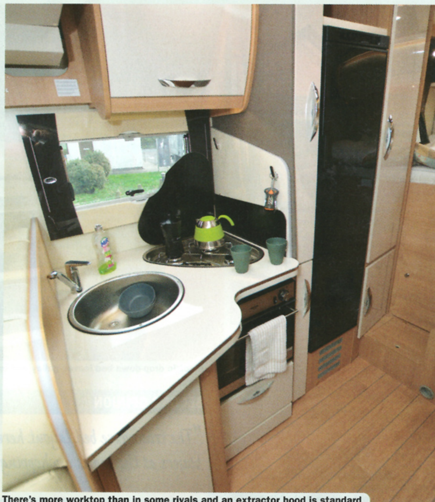
There's more worktop than in some rivals and an extractor hood is standard