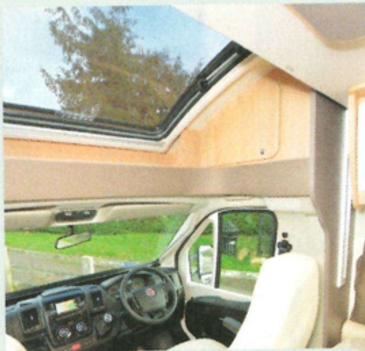
The lockers at the side of the sunroof are much better than the usual open shelves