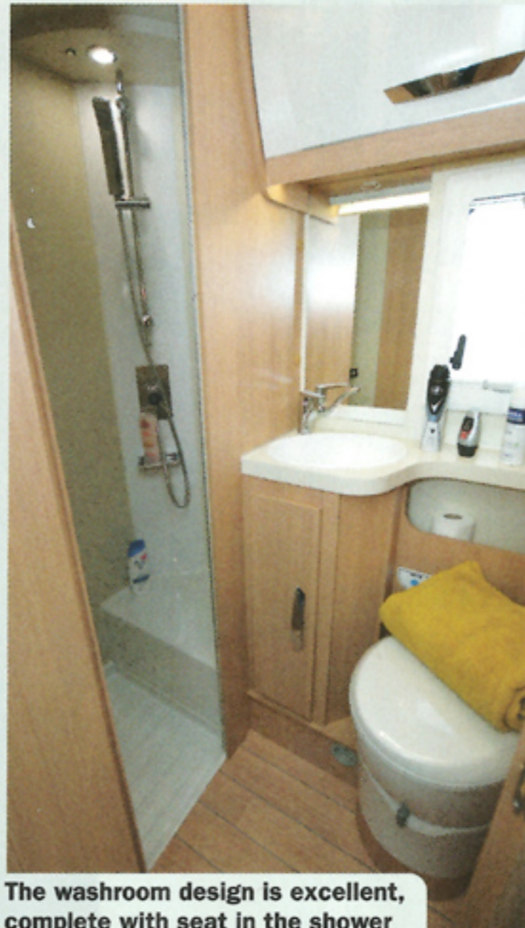
The washroom design is excellent, complete with seat in the shower