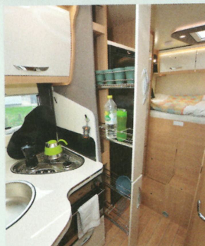
The twin-section pull-out pantry storage is a great feature in the kitchen