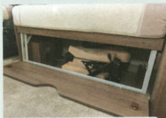
The Aguti travel seats store neatly away