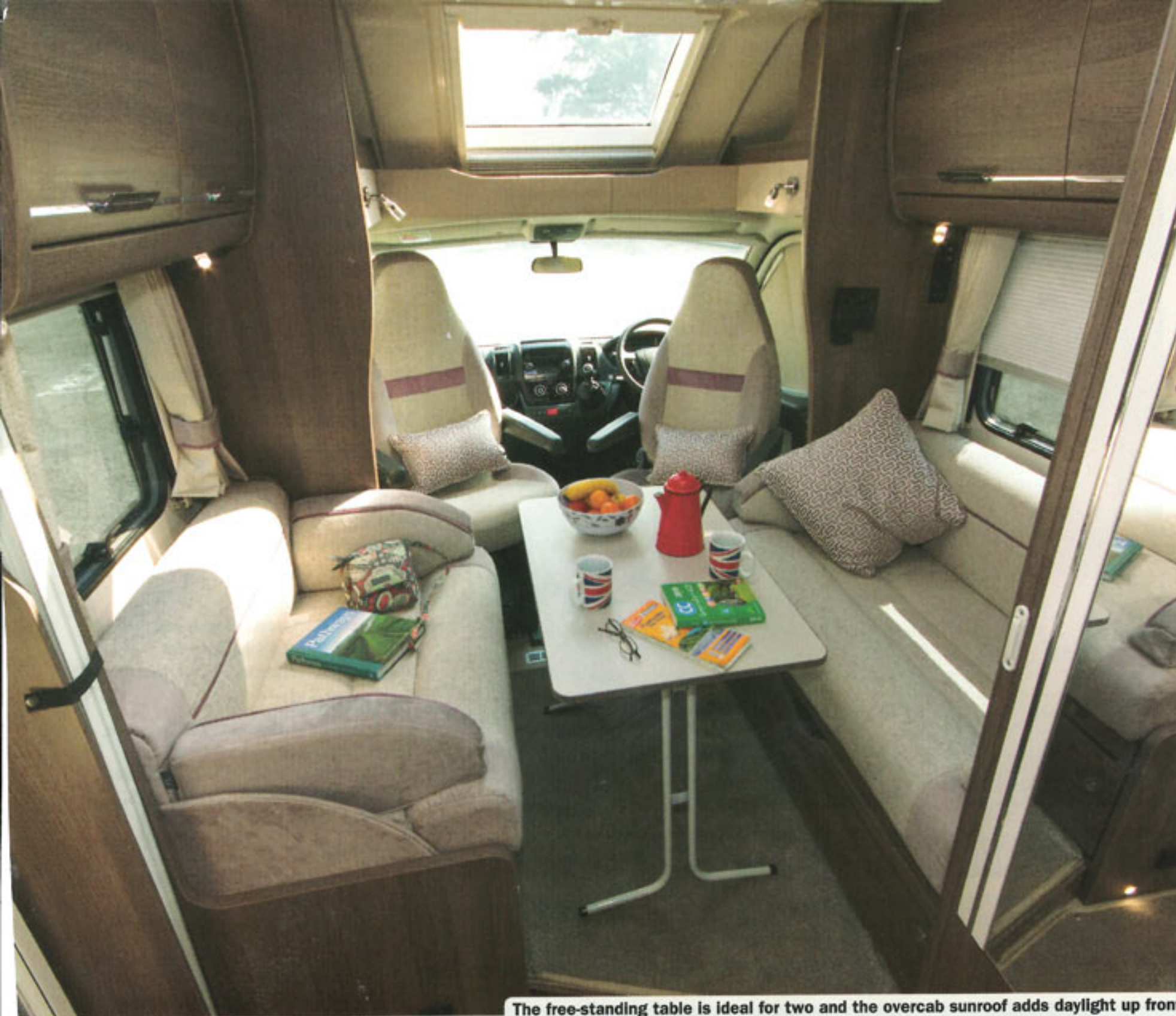
The free-standing table is ideal for two and the overcab sunroof adds daylight up front