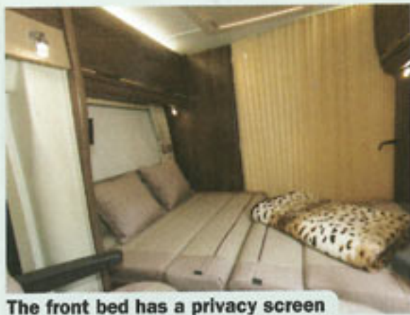
The front bed has a privacy screen