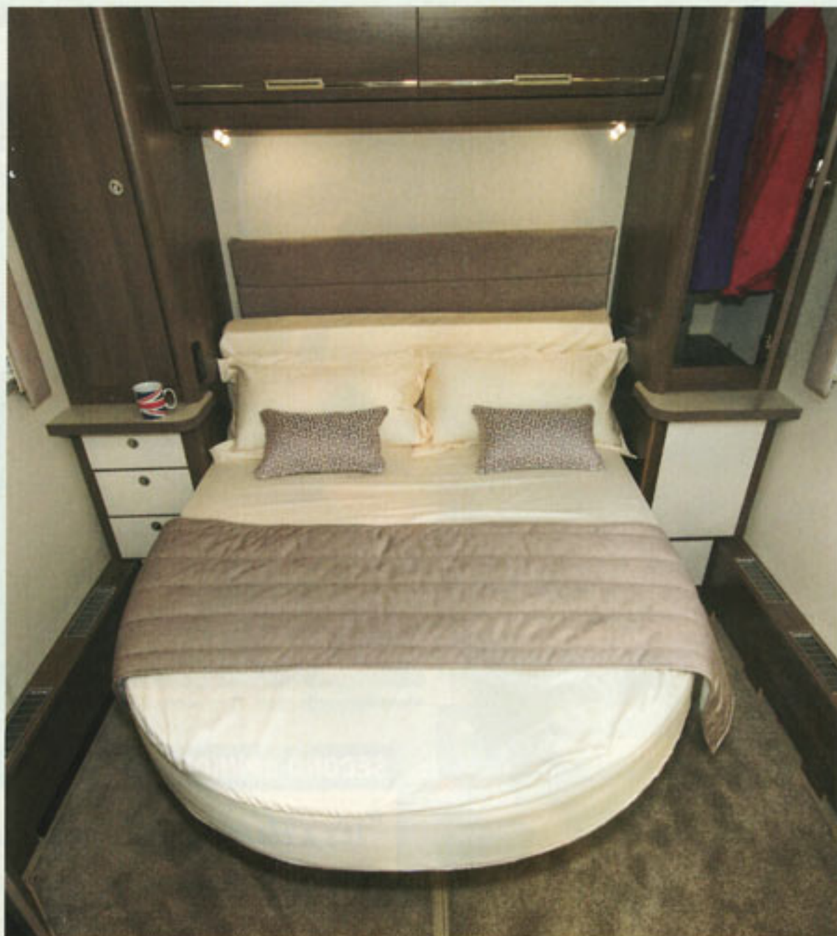
The Hypnos mattress is firm and comfortable; the bed can be retracted during the day

here you can relax, feet-up, on settees. The nearside settee is slightly shorter than the offside's, but you could still happily seat five, six at a pinch. It helps that the cab and lounge share a level floor with just a small step down to the main area. This reduces lounge headroom to 1.88m, but that's still adequate for most.