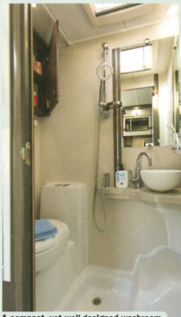
A compact, yet well-designed washroom