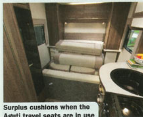
Surplus cushions when the Aguti travel seats are in use