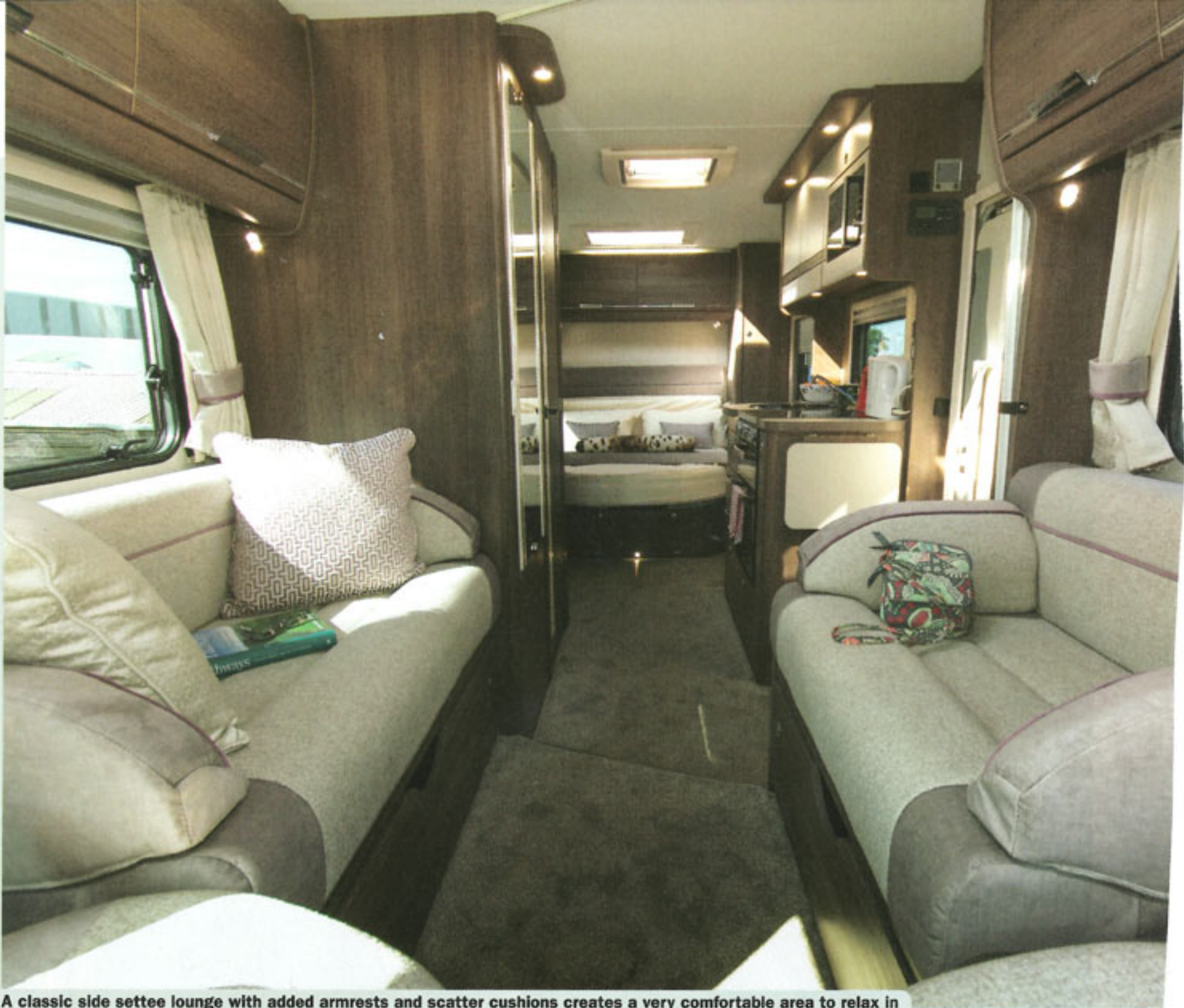
A classic side settee lounge with added armrests and scatter cushions creates a very comfortable area to relax in

The 2020 Eddis motorhome hierarchy runs from the stalwart, six-model Autoquest range, via the four compact Accordos, to the luxury Encores, with a quartet of layouts. Last year's Encore 254 has disappeared, replaced by this new 250; the key difference is the lengthways location of the island bed, unlike the transverse position in the 254. However, the motorhome's overall length remains the same at 7.41m.