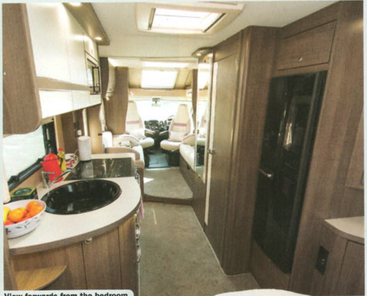
View forwards from the bedroom