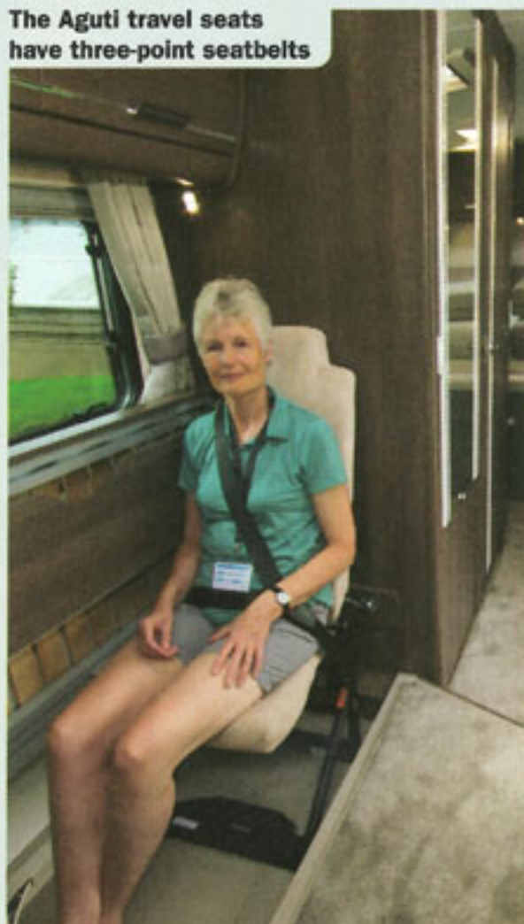
The Aguti travel seats have three-point seatbelts