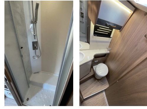
Shower room and washroom straddle the corridor

Everything you need is here, from the Truma Combi 6E hot water and blown air heating to 100l fresh and waste water tanks. You'll find plenty of ceiling and ambient strip lighting and central locking that includes the habitation door. You might appreciate the lower-set gas locker when it comes to getting cylinders in and out. Ditto for the easy-pull dump valve for the waste water.